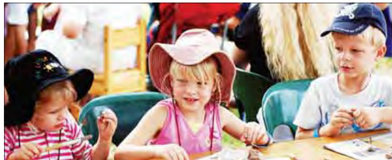
Children enjoy clay sculpture at the 2009 Bowen art festival

Regional Queensland artists could receive between $5000 and $30,000 for their projects as the Australian Government continues to invest in the future of the arts.