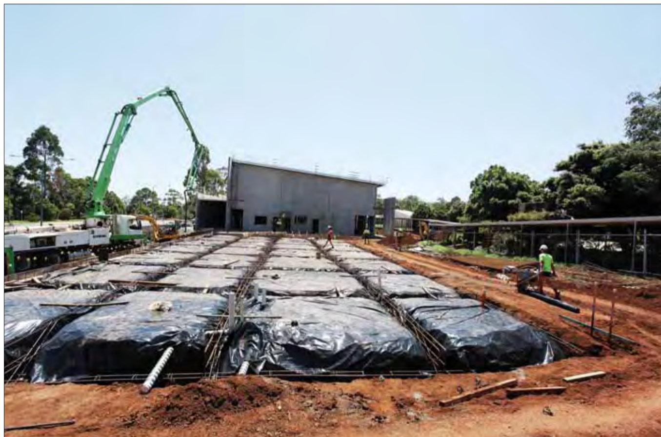
The construction of new buildings at Highfields State School is progressing according to schedule with completion due in around eight weeks. The multipurpose building has its roof erected, and an extra classroom adjoining this is currently under construction. The footings have also been laid for the new library. Covered walkways allowing students to move between classes and buildings in all weather will be built before the official opening. ABOVE: The footings for the new library have been laid and the roof has been erected on the multipurpose building.