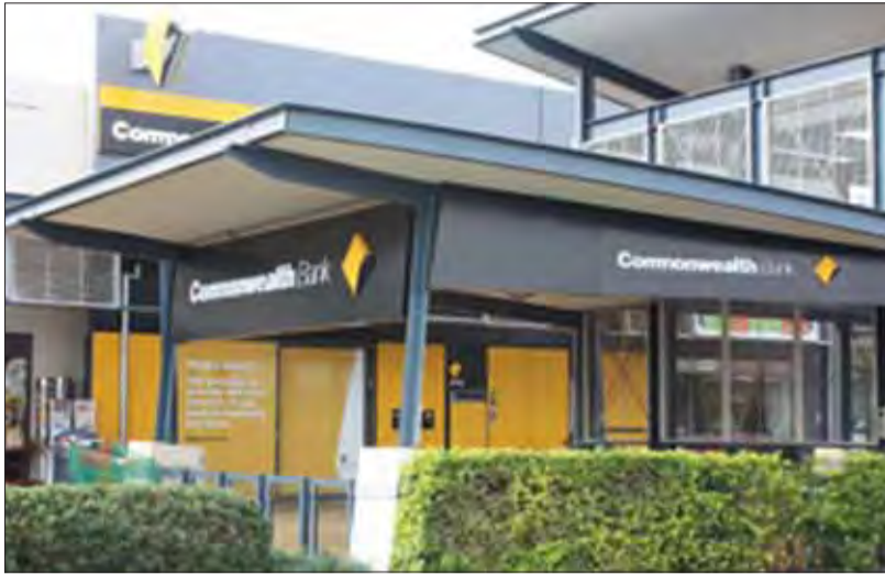
Highfields branch - Open plan service

The Commonwealth Bank will open in Highfields on Monday, March 1.