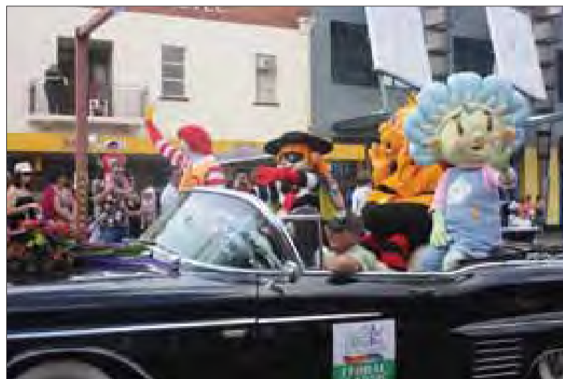
Floral parade - One of the many attractions needing assistance

Organisers of the Toowoomba Carnival of Flowers are looking for volunteers with good local knowledge to help out with the festivities.