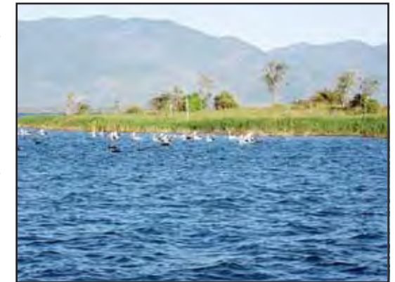
Swan Island - home to numerous pelicans

TO DONATE, CALL 1800 534 229 OR VISIT LEGACY.COM.AU