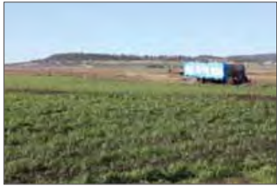
FELTON VALLEY Scene of landholder concern

The new laws apply to the activities of companies involved in minerals, petroleum and gas, geothermal and greenhouse gas storage exploration and development. This includes minimising any impacts from exploration and development activities on land, which would affect livelihood and lifestyle of residents.