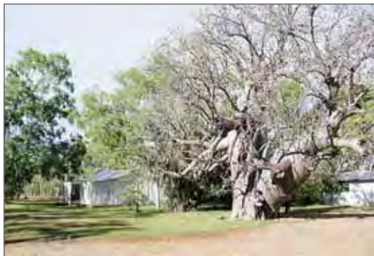
Boab - Unique to a small area in W.A.

diles - No Swimming" reminded us to stay away from the water.