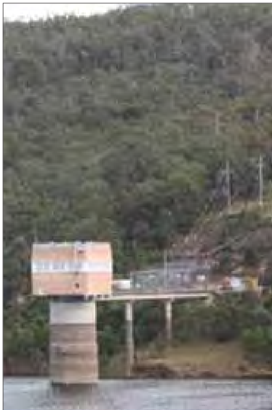
Perseverance Dam - Now at 28.2 per cent.