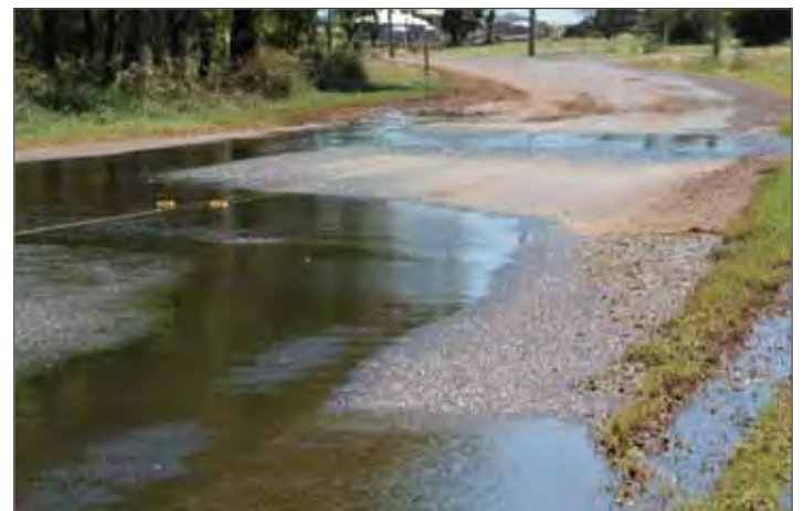
Heavy rain in January has caused springs to break out at Gowrie Junction, left Burkes Road, right Gowrie-Tilgonda.