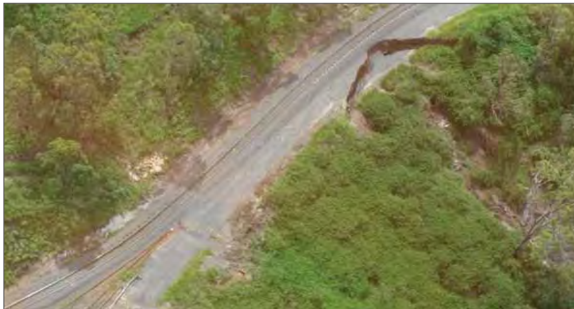
Bird's eye view of damage on the line between Harlaxton and Spring Bluff.