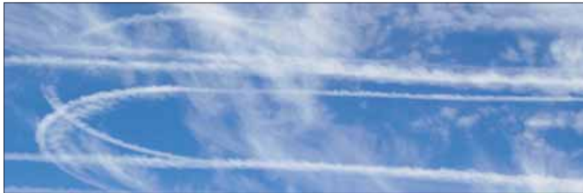
The jet trail was the most popular subject for our readers' photos this week.