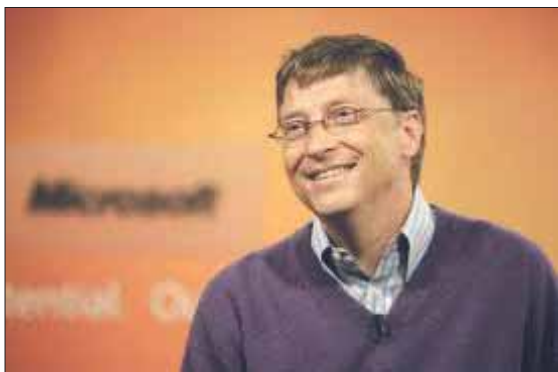
Bill Gates - No resemblance to real life

7. Before you were born, your parents were not as boring as they are now. They got that way from paying your bills, cleaning your clothes and listening to you talk about how cool you