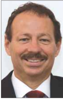
Industry Council is launching a public awareness campaign to remind homeowners why

using licensed plumbers and drainers is the simplest and most effective way of ensuring that plumbing work complies with local council regulations.